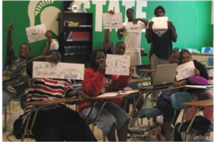
Students at Hope Middle School in Milwaukee engage in an archeology class through the PAVE-supported Summer of a Lifetime in 2007.

PAVE's summer partners will focus on building math, reading, writing, and science skills; and most will offer enrichment activities such as music, organized sports, and visual arts. Over